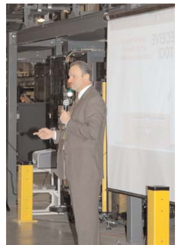
Palatine FSS Tour